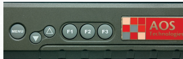
Dedicated control buttons for quick access to menu, exposure time, and user-specific camera settings.